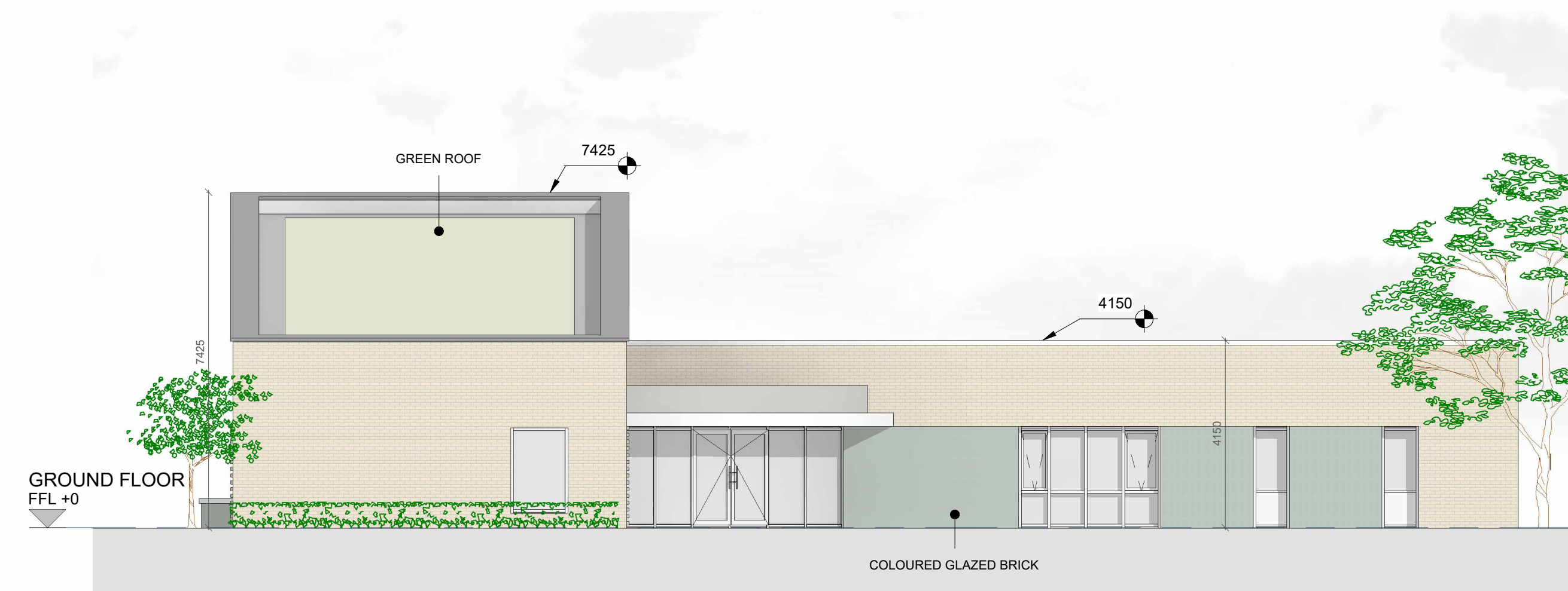
REAR ELEVATION SCALE: 1 : 100