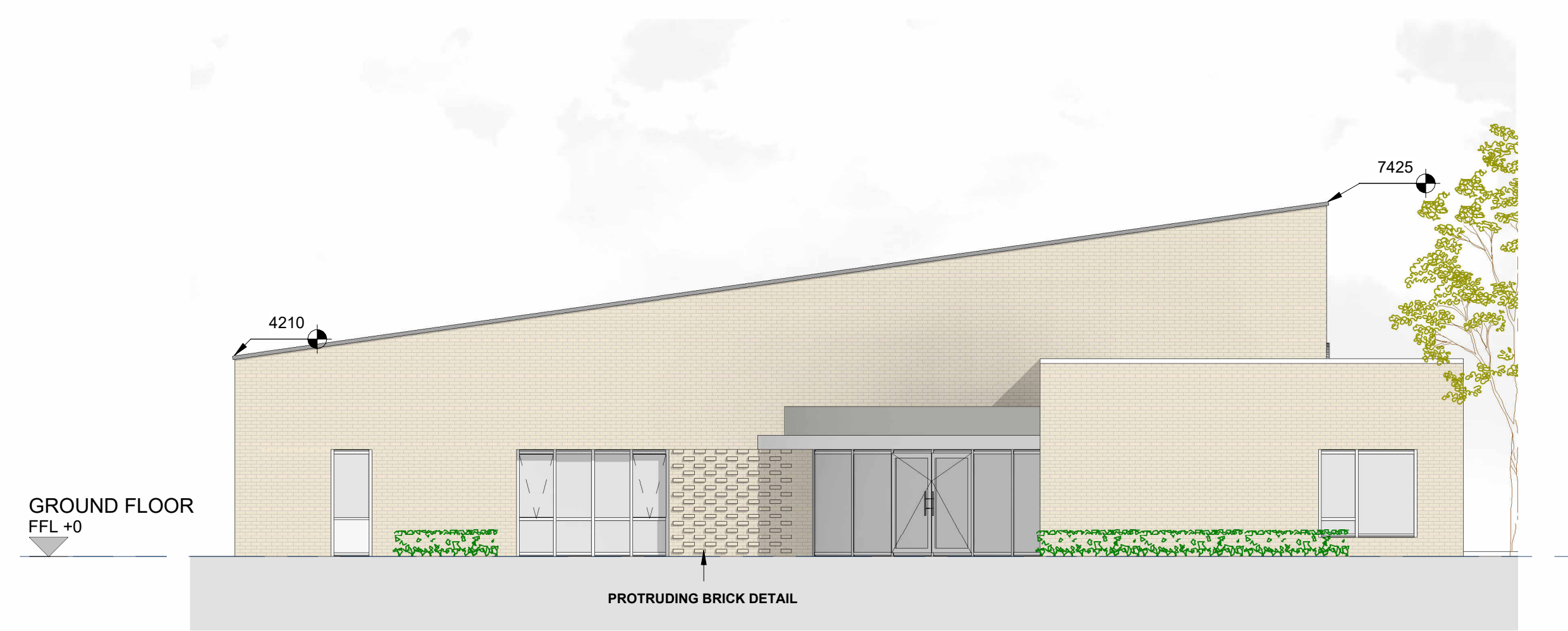
SIDE ELEVATION 2 SCALE: 1 : 100