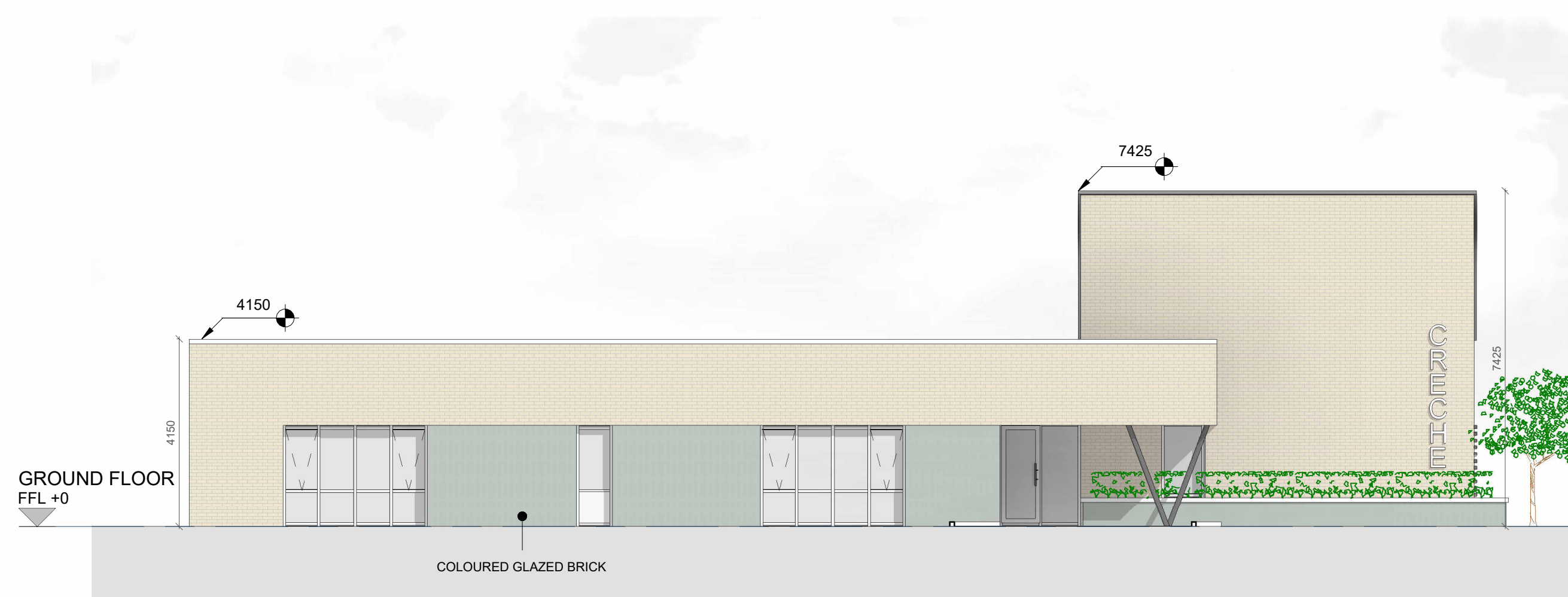
FRONT ELEVATION SCALE: 1 : 100