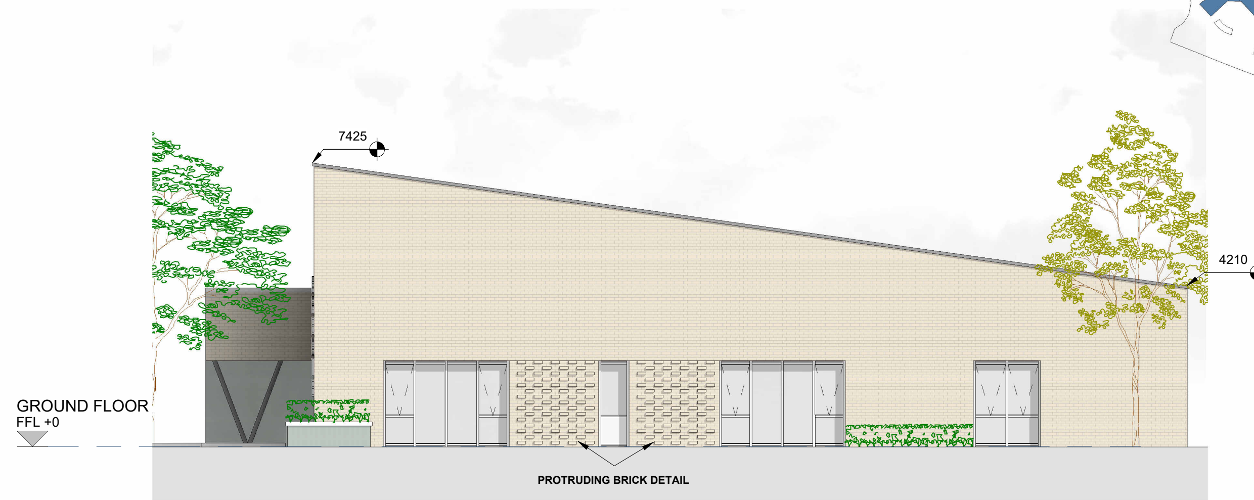
SIDE ELEVATION 1 SCALE: 1 : 100