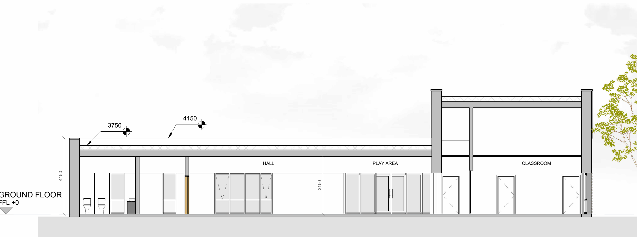
SECTION A-A SCALE: 1 : 100